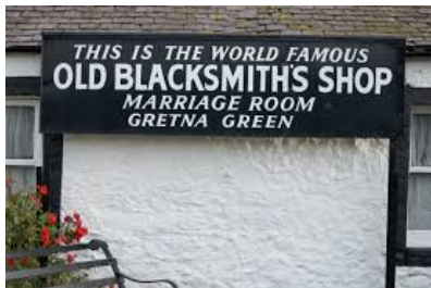
Gretna Green Marriage Register 1794 – 1895

http://search.ancestry.co.nz/search/db.aspx?dbid=1636