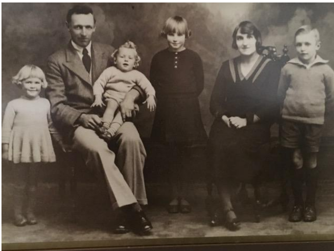
This photo is from Australia. It is thought they belong to families around Gore area. Can anyone recognize anyone in these photos? Please Contact Vicky 204 6873