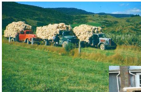
Stripped, bleached, 'hanked' fibre ready to go into the scutching shed