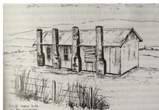
Single mens huts