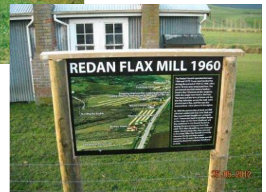
Restored huts and road sign at bottom of hill Redan